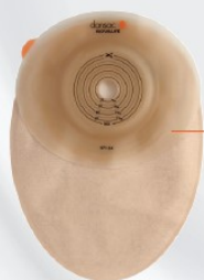
NEW NovaLife Soft Convex