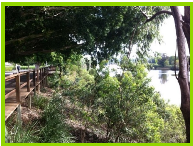
HASTINGS RIVER, WAUCHOPE MID NORTH COAST, NSW