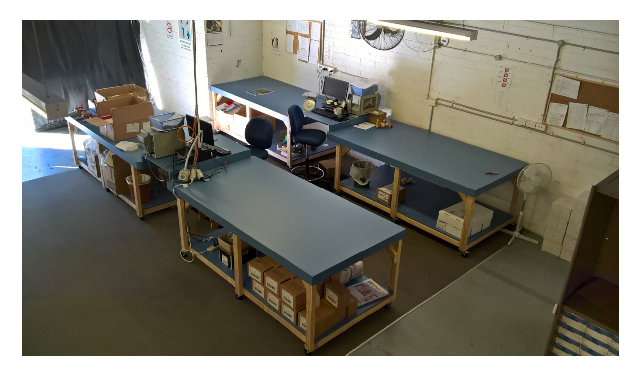
\underline{\text{PHOTO}}\textsc{:} New work benches improve the flow of products in our warehouse.